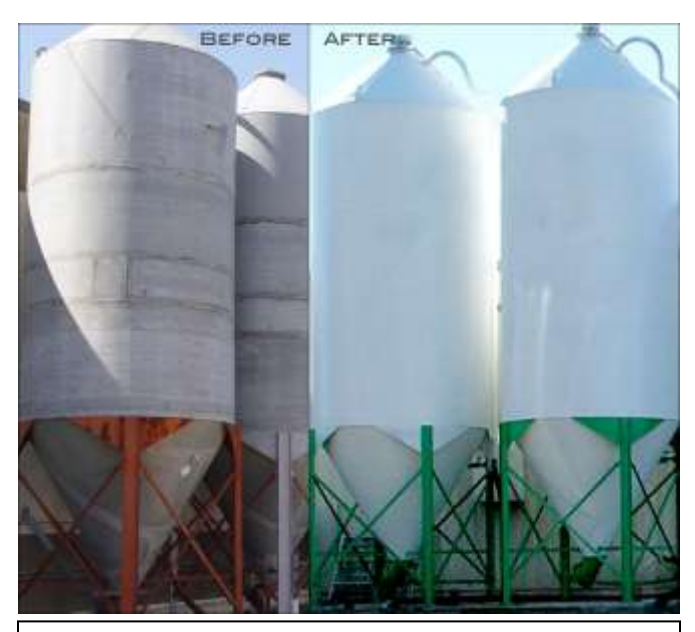
VpCI^{\circledR} 386 White, applied over weathered galvanized steel offering 10 + years of corrosion protection.

VpCI®-386 is a clear coating that allows visual inspection of the metal surface after application. It can be easily pigmented with pigment dispersions. The coating is washable, has good chemical resistance and is UV resistant, giving optimal outdoor performance without cracking or chipping upon prolonged exposure to sunlight. It is effective over wide array of substrates; galvanized, carbon and stainless steels, cast iron, aluminum, copper, concrete, wood, plaster and masonry. The product requires minimal surface preparation, compared to conventional primers that require sand blasting.